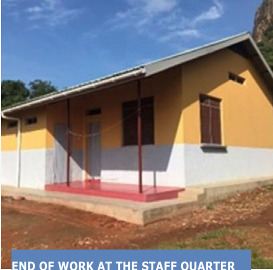
END OF WORK AT THE STAFF QUARTER